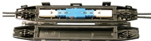
SC Connector Connection